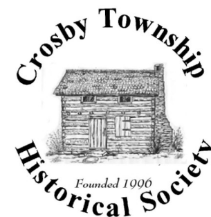
Cabin sketch by Bev Torres

CROSBY TOWNSHIP HISTORICAL SOCIETY 8910 WILLEY ROAD, BOX 12 HARRISON, OH 45030-9774