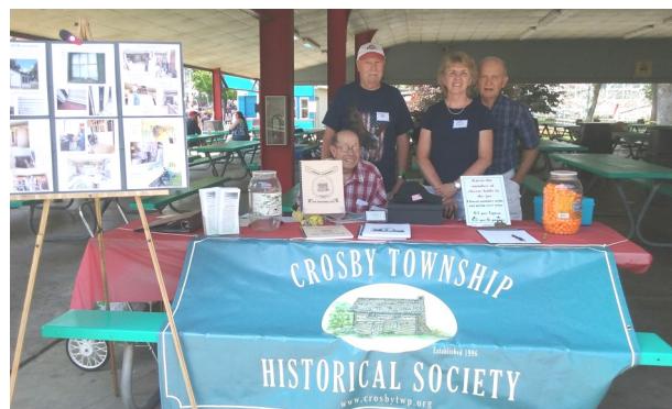
Society display & members