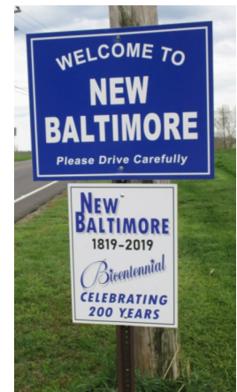
New B Bicentennial