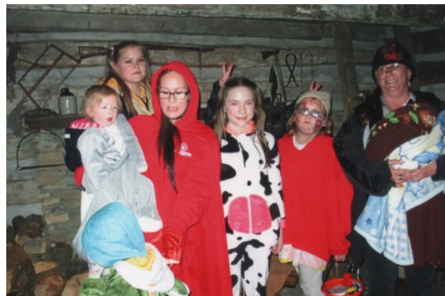
Trick or Treat