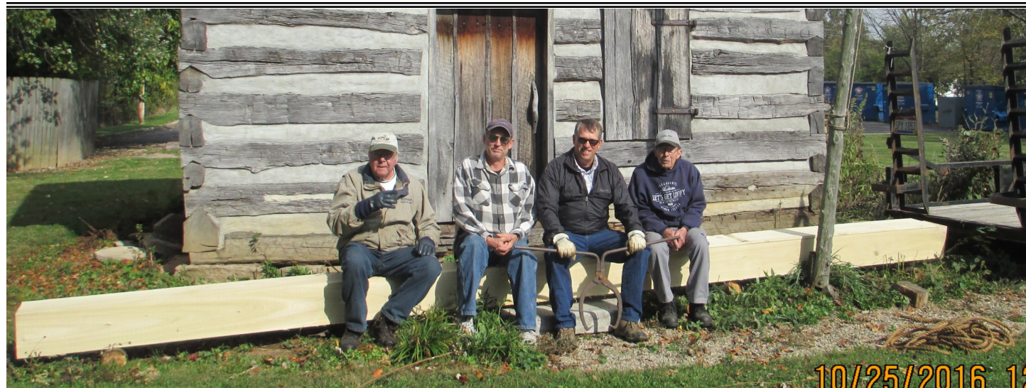
The new log unloaded, the crew takes a rest.