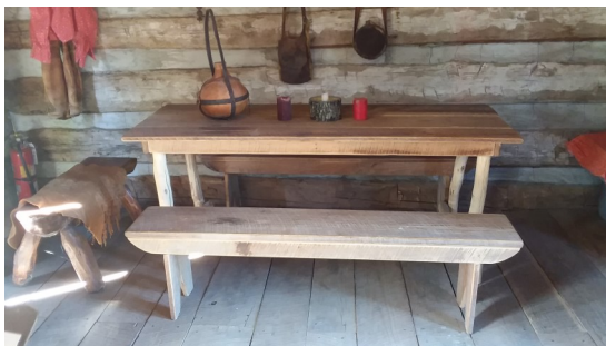
Cleaned items that were rearranged (left)

Inventorying items proved to be a little challenging. Thank goodness for the Board members who knew what most of the items were!