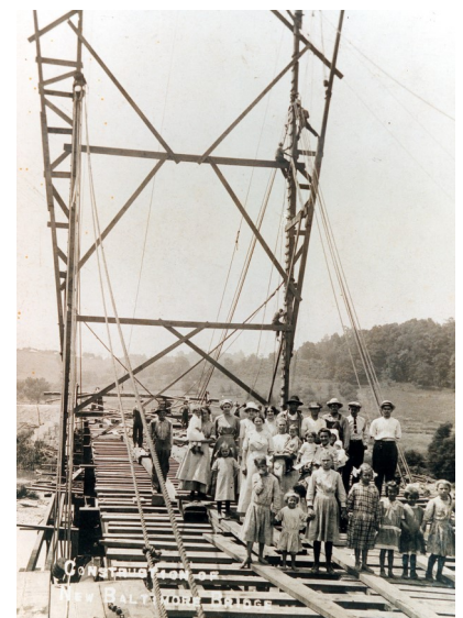
“Singing Bridge” under construction

At a cost of $3.5 million, a 600 foot bridge was constructed directly across from Blue Rock Road to replace the “singing bridge”. The new location was better suited for straight-through traffic. This bridge consisted of a reinforced concrete deck supported by pre-stressed concrete beams on a reinforced concrete drill shaft substructure. The weight limit is 40 tons. This structure was dedicated by count officials in 2001. Local residents were present to observe the ribbon-cutting ceremony.