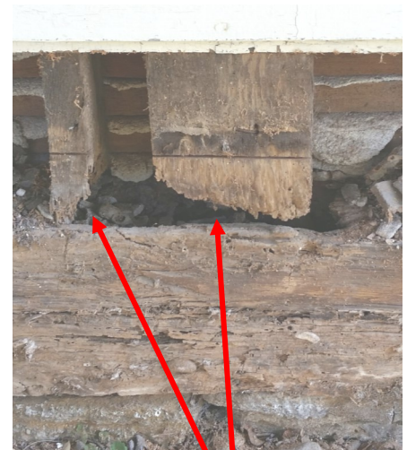
Vertical boards holding up walls and roof that have disintegrated above sill plate

the roof and logs with a wood preserver. Plans are on the drawing board to wire electric from the fire house to the cabin. This will give us easier access for lighting the cabin or for any other use where electric is required.