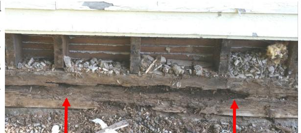
Disintegrating sill plate

On the morning of Saturday, July 20, Duane and volunteers met at the Old Town Hall to expose the south side of the foundation to see if there was any damage to that portion of the sill plate similar to that on the north side. Extensive damage was found. The south side was then re-covered. Currently we believe, in order to repair the foundation, the following will need to occur: the inside floor will need to be removed to get to the interior sill plate; the ends of the floor joists will need to be cut where they sit on the sill plate; they will need to be braced on the building side that will be slightly elevated to remove the old sill plate and be replaced with a new one; and then the floor joists will need to be re-attached to the new sill plate. Little other work can be accomplished on the building until this is done. Because of these delicate procedures and safety concerns, it was decided by the board members to get quotes from experienced contractors to do the work and present the information to the township trustees.