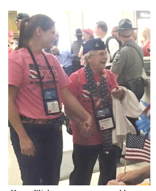
Honor Flight woman veteran and her guardian returning to CVG airport on the evening of September 22, 2015.